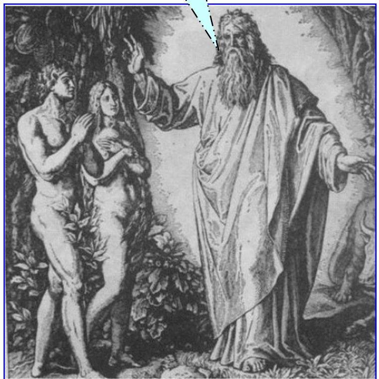
God instructs Adam and Eve

It is the most difficult commandment to observe, because even the first human couple, Adam and Eve, transgressed it [GS.02_080,19]